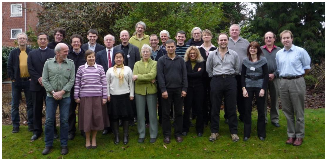
Figure 2: The CLIMSAVE consortium

Further information on the project, including a 2-page project flyer can be obtained from the CLIMSAVE website ( www.climsave.eu ) or the Project Co-ordinator: Paula Harrison ( paharriso@aol.com ). A full report on the vulnerability framework can be downloaded from the CLIMSAVE website. Further information on the vulnerability framework can also be obtained from the WP5 co-leader: Ines Omann ( ines.omann@seri.at ).